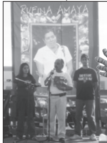
Rufina Amaya, only witness of El Mozote Massacre on banner behind stage