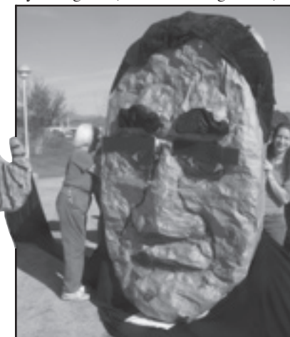
Bishop Oscar Romero Puppet